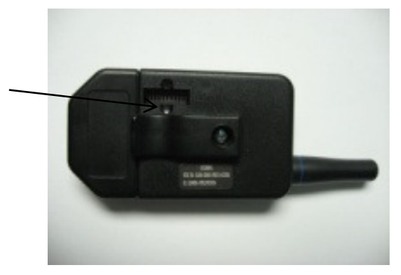
Switches are located on back side of transmitter, on side opposite the antenna, under a small plastic cover. Use the end of a pen to change the position of one or more of the switches.

In the LRN Menu, under SET-UP, hold down Green ▶ button for 5 seconds and wait for countdown to begin. Press and hold any button on the remote transmitter. When DONE flashes in the display, the transmitter is programmed.